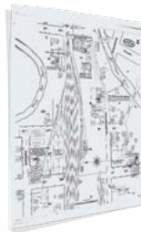
Fire Insurance Maps (FIMs)