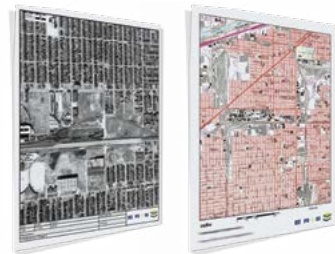
Historical Aerial Photographs and a current Topographic Map