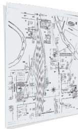
Fire Insurance Maps (FIMs)