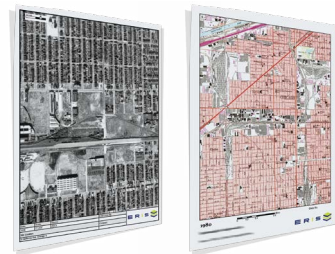
Historical Aerial Photographs and a current Topographic Map